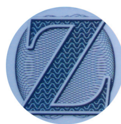
ZXP SERIES 9 600 DPI