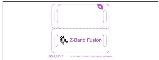
Part Number: FID-BABY-T-1-500

For more information about the Z-Band Fusion, visit www.zebra.com/wristbands or access our global contact directory at www.zebra.com/contact