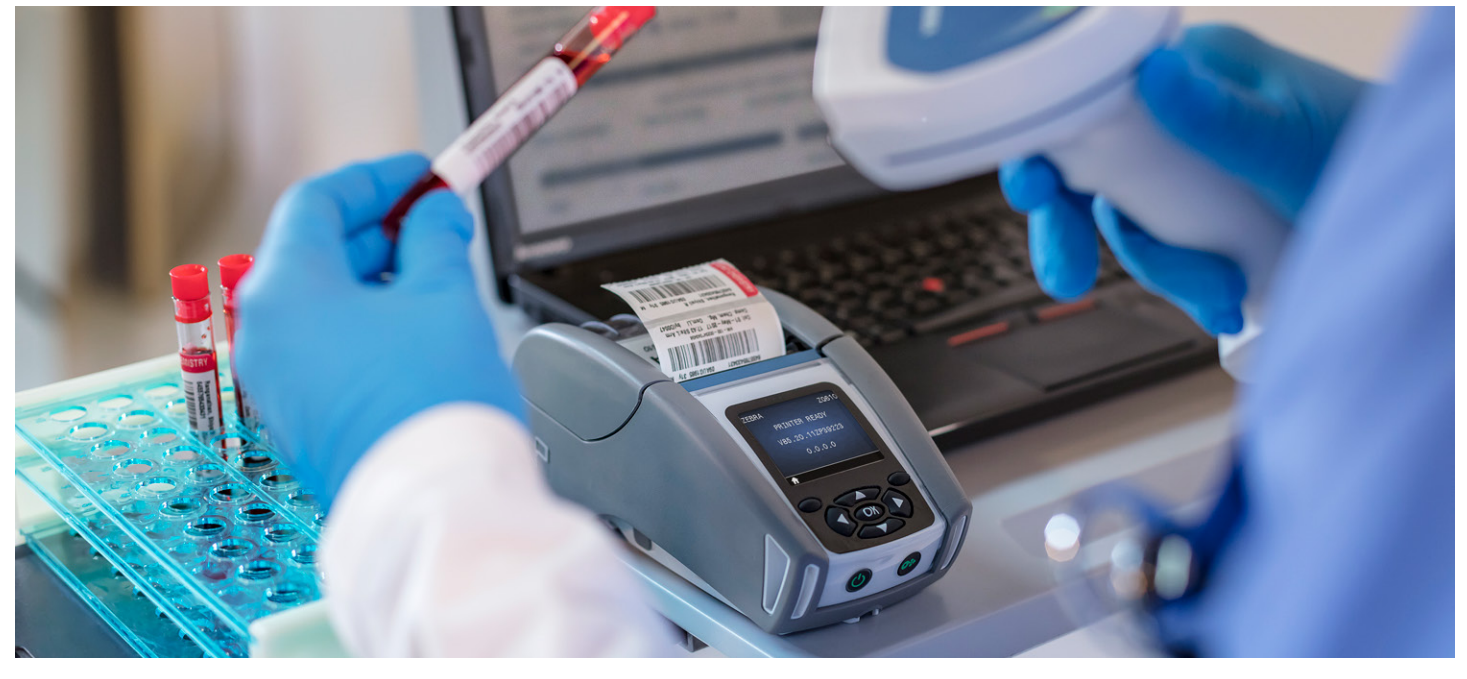
NOTE: Some product photos might look different than the actual product.