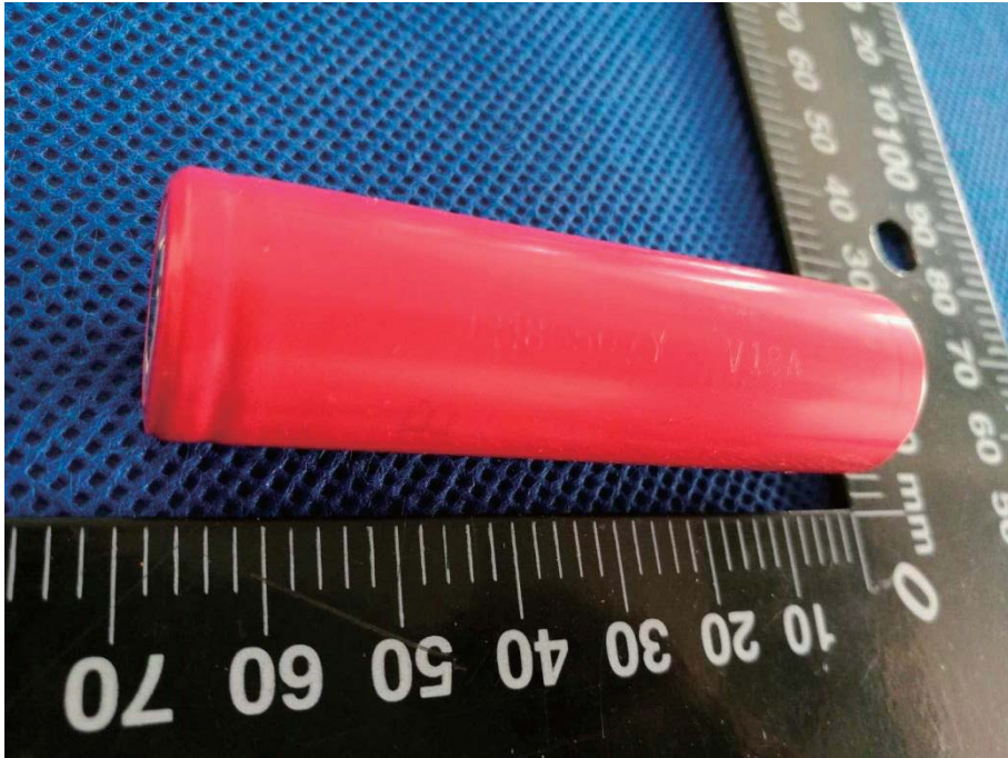
元件电池 Component cell