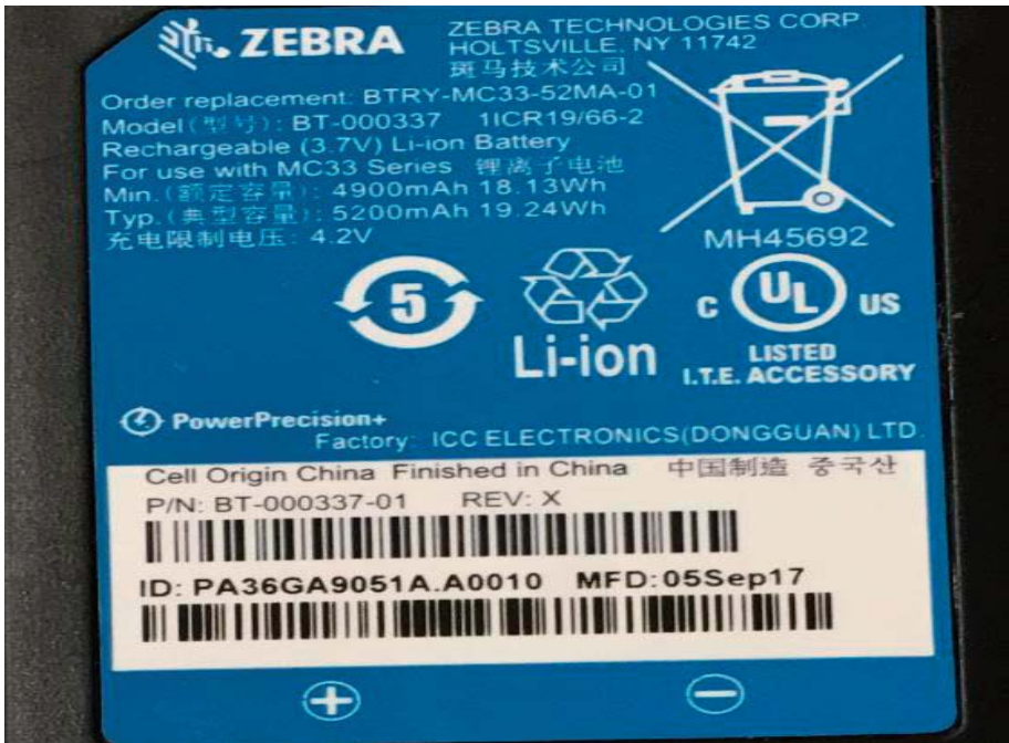
电池组铭牌 Battery Nameplate