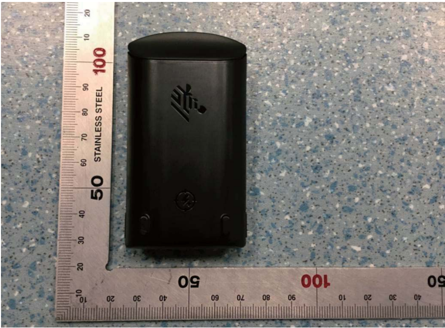
电池组外观 Battery appearance