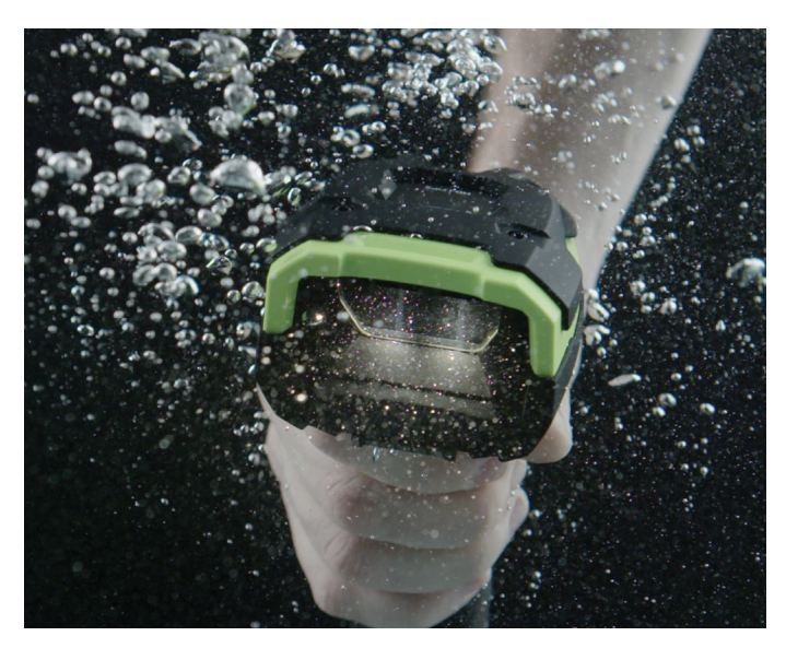
Whether you are manufacturing vehicle cam shafts, computer circuit boards or whole-grain bread, your operations will benefit from the unmatched durability, scanning performance and manageability of the 3600 Series.

The 3600 Series is the only device in its class with a waterproof IP65/IP68 sealing rating, able to survive