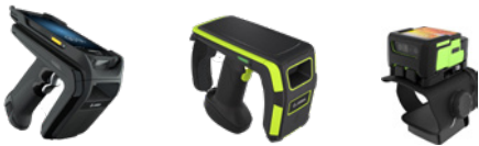
Handheld / Hands-Free Readers