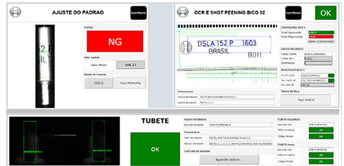
Screen showing the necessary adjustments to build unwrapped image with segments of injector cylinder.

Using the new vision system, the Curitiba plant achieves production volumes of 7,000 parts per day and has decreased the daily percentage of false rejects to 5%, a significant improvement over previous iterations.