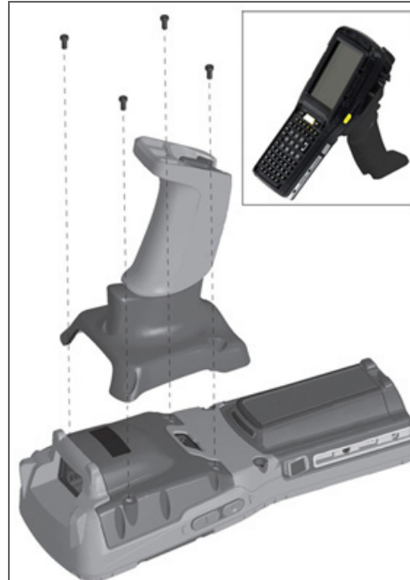
Figure 2 Attaching the Pistol Grip