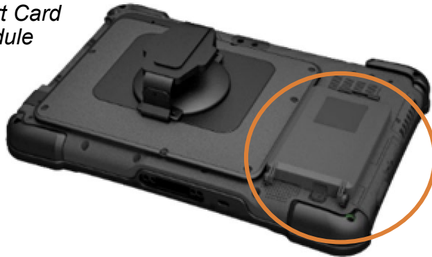
CAC / Smart Card Reader Module

Note: Must be ordered at the time of tablet purchase (factory installed)