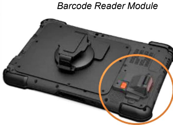
Barcode Reader Module