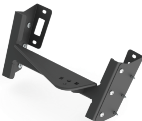
Vehicle Bracket Only 601.837.01