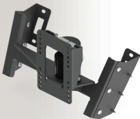
Standard Full Vehicle Kit 601.837.11 Swingaway Full Vehicle Kit 601.837.12