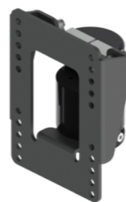
Standard Tilt and Rotate Unit Only 601.825.01 Swingaway Tilt and Rotate Unit Only 601.825.02

For more information, contact your local Motion Reseller or Motion Representative.