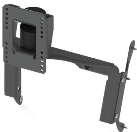
Standard Full Vehicle Kit 601.846.11 Swingaway Full Vehicle Kit 601.846.13