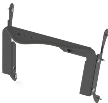
Vehicle Bracket Only 601.846.01