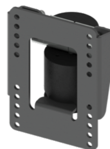
Standard Tilt and Rotate Unit Only 601.825.01 Swingaway Tilt and Rotate Unit Only 601.825.03

For more information, contact your local Motion Reseller or Motion Representative.