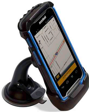
TC55 Vehicle Cradle CRD-TC55-VCD1-01