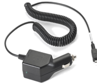
Auto Charge Cable VCA400-01R