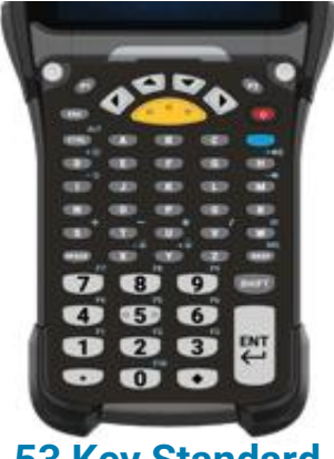
53 Key Standard