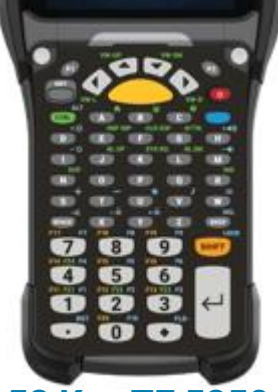
53 Key TE 5250