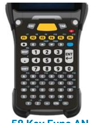
58 Key Func AN KYPD-MC9358ANR-01 KYPD-MC9358ANR-10