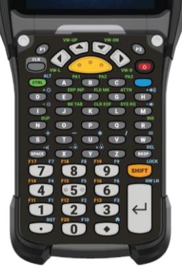
53 Key TE 3270