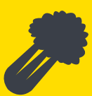
Celery & Celeriac