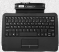
Companion Keyboard & KickStrap*

Docks, batteries, kickstands, keyboards, and other accessories can be shared across all Xplore L10 tablet models. Plus, L10 accessories purchased today will remain fully compatible with future-generation L10 rugged tablets.