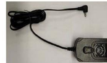
PWR-WUA5V4W0US Power Supply 5.2v, 1.1A